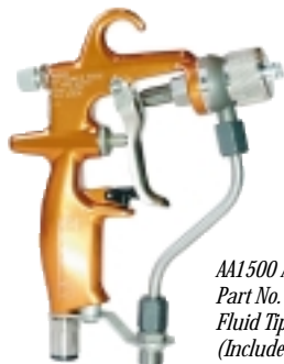
AA1500 Air Aisst Airless Spray gun Part No. 1500-1210-2 Fluid Tip Part No. 113-01210 (Included in Package)

Part No. 98-3072 (UHMWPE) - 98-3073 (Teflon™) Cart-mount outfit is a complete finishing system for mobile flexibility. This outfit includes pump, air controls, cart, gun filter, spray gun with tip and all standard hoses. Shipping weight 35.5 lbs (16.1 kg).